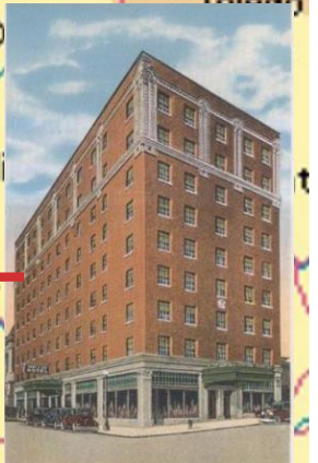
Robert E. Lee Hotel St. Louis, Mo Likely Spent the night here on Nov. XX th , 1956