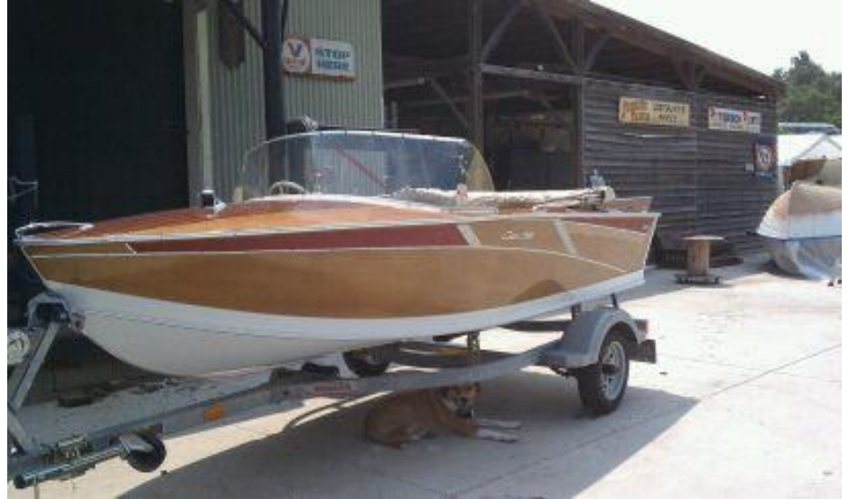
Casey Hodges 1957 Sea Lark "Hurricane Minnie" Venice, Florida