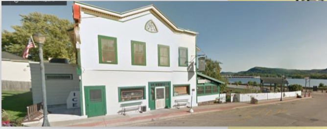
Trempealeau Hotel & Saloon Trempealeau, WI. Likely Spent the night here on Nov. 16 th , 1956